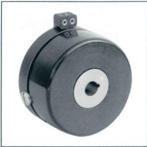
Cat No 24033 Type FS 80/1S Standard Hub

CLARK ELECTRIC CLUTCH TYPE FS/1 FAIL SAFE BRAKES are multi-spring operated electromagnetically released. They are engineered to a very high standard for incorporation into the highest quality machines. They feature a provision for checking and adjusting for wear without dismantling.