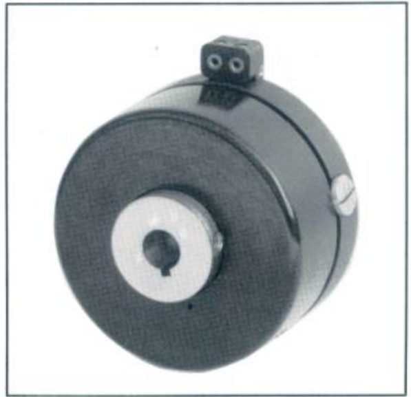
Cat No 24034 Type FS 80/1L Long Hub

Type FS/1 Brakes may be used in both dynamic braking and holding applications. The constructional principles are shown in this diagram.